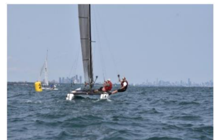
Cancelled due to weather conditions